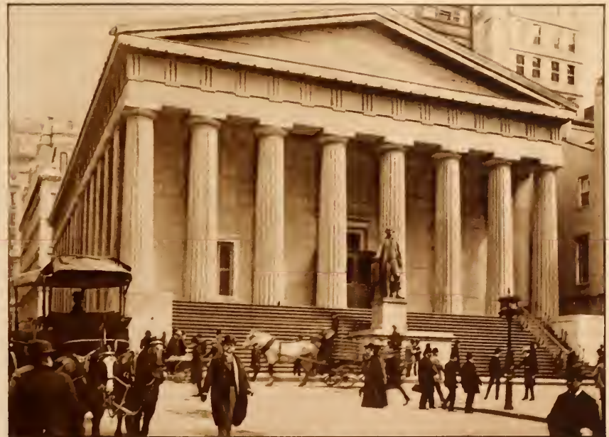
SUB-TREASURY BUILDING, BROAD AND WALL STREETS.